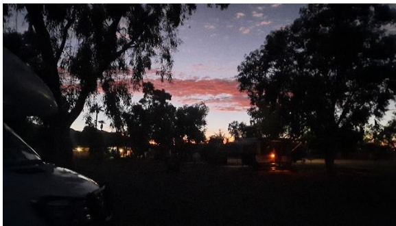
Sunrise at the KOA