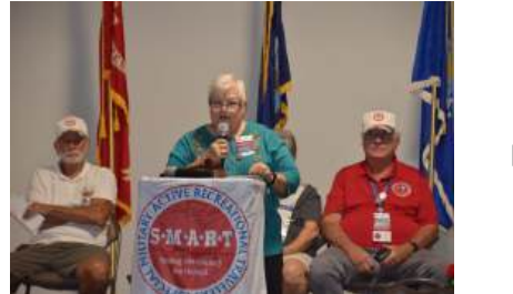
First Timers Meeting!