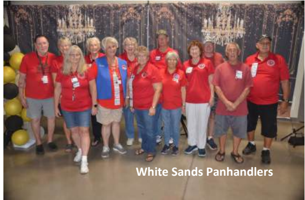
White Sands Panhandlers