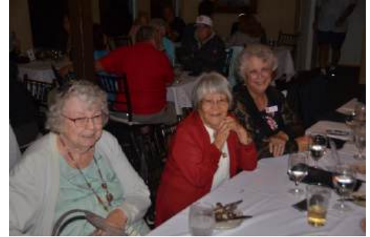
Boat Dinner Cruise