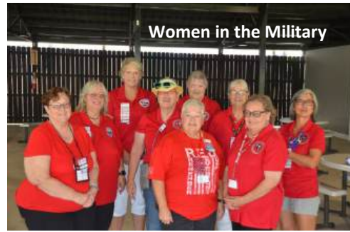
Women in the Military