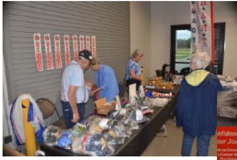
Some of our Vendors getting set up...