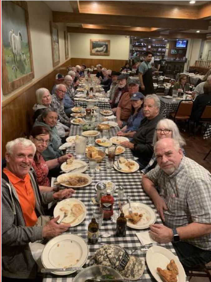
Photo 1 dinner at Wool Growers Basque Restaurant. Photo 2 the group at Portrait of a Warrior Gallery