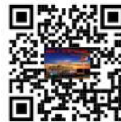
Murder Mystery Preview Video

See the next page for some of our activities.